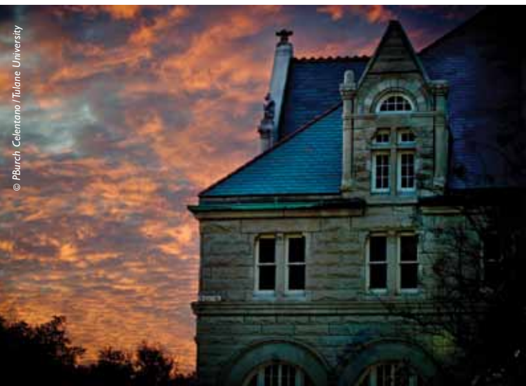
Tulane's Tilton Hall on St. Charles Avenue is home to The Murphy Institute.