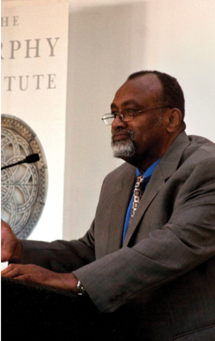
Tulane University Campus, Lavin-Bernick Center, Qatar Ballroom Thursday, January 21, 2010